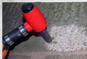
Reducing Levels on Concrete