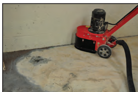
USE WITH TCG250 FLOOR GRINDER