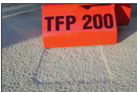
USE WITH TFP200 FLOOR SCARIFIER